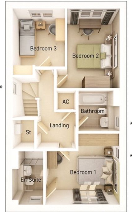
* Plot specific window